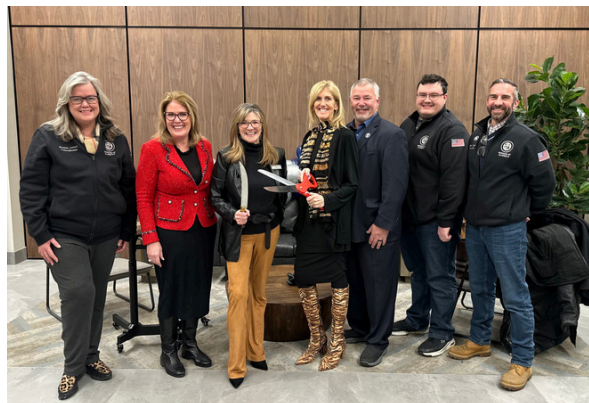
The Allendale Mayor & Council with Senator Holly Schepisi at the Grand Opening of the Allendale Community Center, January 23, 2025.