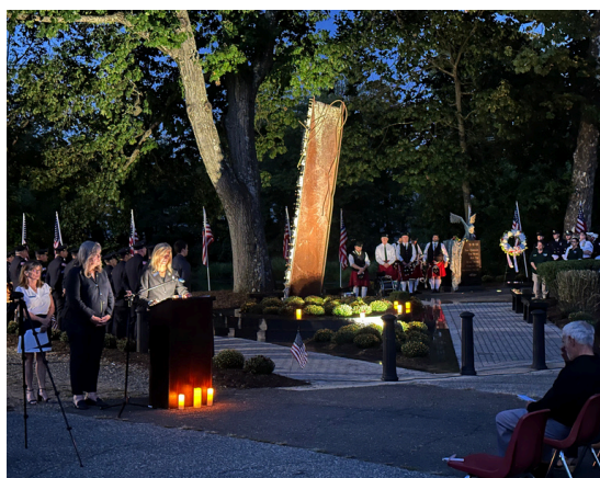
9/11 Candlelight Memorial Ceremony