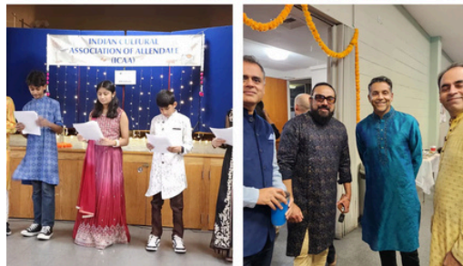
The Indian Cultural Association of Allendale held their annual Diwali celebration on November 16th.