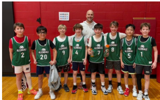
The ARC rec basketball season wraps up this week. Above, Team Monaco, one of the teams in the finals.